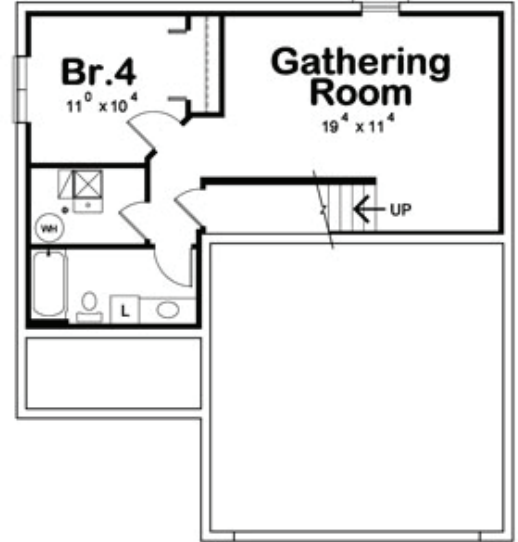
Optional Lower Level